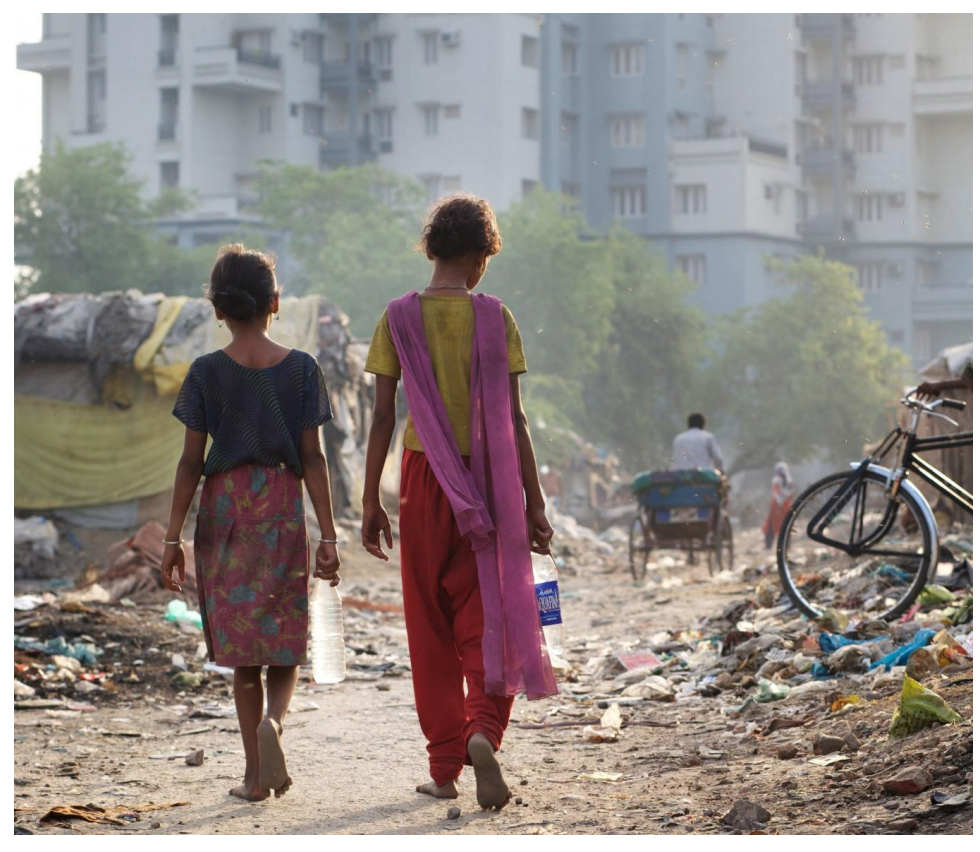
Housing for the wealthier middle classes rises above the insecure housing of a slum community in Lucknow, India.