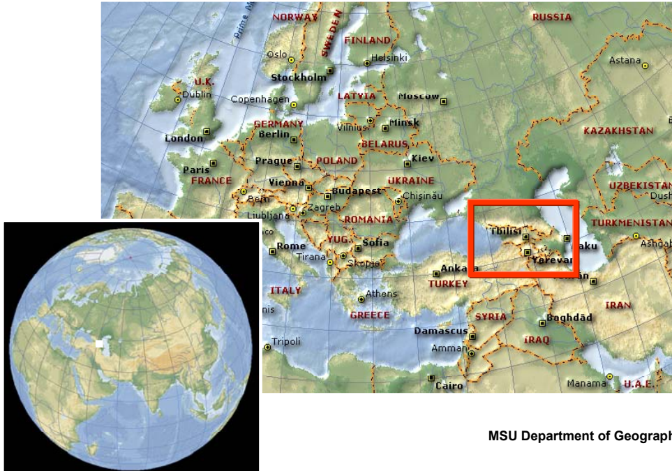
MSU Department of Geography 2001