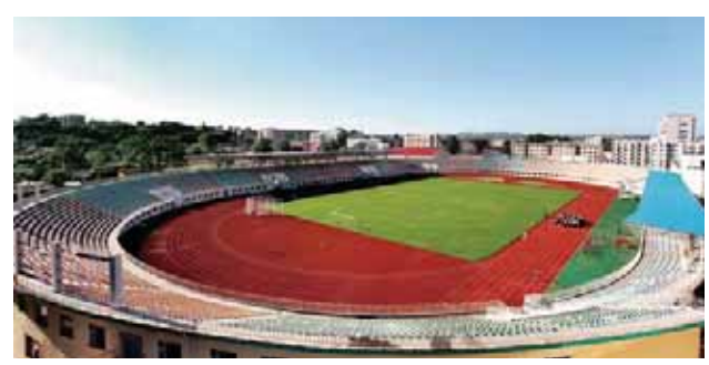
The Open Space for Citizens' Recreations, Entertainments and Sports - People's Sports Center.

Liaoyuan throve for coal, and declined for coal, too. It is a typical resource-exhausted city. In 2006, Liaoyuan Municipal Party Committee and the Municipal Government seized opportunities, and was initially listed in the first group of 12 experimental cities of resource-pattern economic transformation in China. In the transformation process, the city transformation and the economic transformation were implemented simultaneously, and the economic and industrial structures were optimized by way of economic transformation; while the development space of the urban area was enlarged and the competitive force of the city