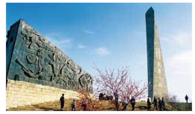
Monument of the Great Battle of Hundred Regiments

concentrative heating supply rate is more than 90%, the urban gas popularization rate has reached 86.6%, and the city's innocuous treatment rate of domestic garbage has reached 91.02%. During the whole year, there are 353 days when the city's air quality reaches or exceeds Level II, the urban water supply popularizing rate has reached 100%, the comprehensive conformity rate of water quality has reached 99.68% and the city's sewage treatment rate has reached 82.24%. Especially, since 2005, we have carried out the large-scale comprehensive mullock treatment project. With more than four years of efforts, Yangquan has invested a total of 220 million Yuan, accomplished the tasks of 4300 mus of mullock treatment at 26 locations. The previous "hot mountain" is now dressed in green, and Yangquan is taking a lead in China, in respect of treating its mullocks scientifically.