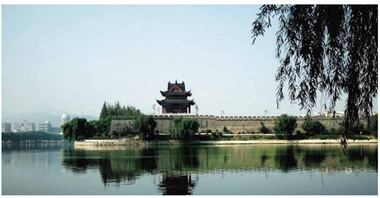
Xiangyang Moat is the widest one remained in China, and the widest position is 60 meters wide. After years of rectification, the moat is clear to the bottom now. This is a small part of the moat and Xiangyang's ancient circumvallation.

"This is a real city. By depending on steep mountains and a torrential river, it becomes a scenic spot covering miles around, which wins beautiful landscape externally and human culture internally. It was a business center in ancient times, and has nowadays become an important inland traffic and logistics hub. It gathers the essence of the landscape." --- This is what was mentioned in the award speech when Xiangfan won the title of the first group of "Charming Cities in China".