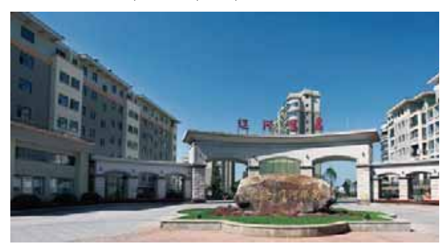
Modern Garden-like Habitation Area with Unique Architectural Design and Pleasant Environment.

was enhanced through city transformation. In respect of economic transformation, the development position of 6 succeeding and substituting industries (i.e., new materials, new energy, biological health, equipment manufacturing, metallurgy & building materials and socks textiles) was specified. The unique transformation policies were noticed by investors. The development was full of vitality and vigor, and successfully shook off traditional development modes.