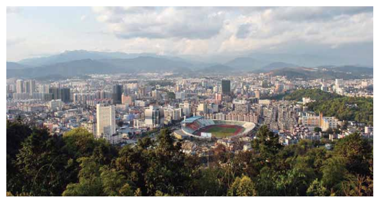
Bird's-eye view of the central city area of Longyan City

As one of the nine cities of Fujian Province divided into districts, Longyan City is located at the junction of Fujian Province, Guangdong Province, and Jiangxi Province, which is generally called "Minxi (the west of Fujian Province)", and to the west bank of Taiwan Strait. There are seven counties/cities/districts with a total area of 19,000 square kilometers and a total population of 2,933,000 under the administration of Longyan City. Longyan City is an important traffic hub for expanding the economic region of the west bank of Taiwan Strait to the north and the south, connecting the Yangtze River Delta and Pearl River Delta, and expanding economy to the central region of China.