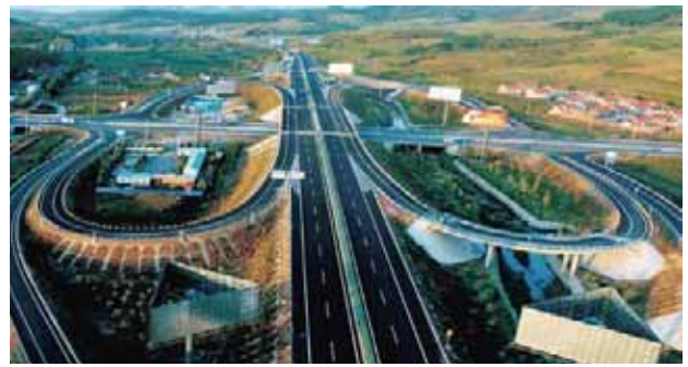
As a road network composed of three ring roads, four north-to-south roads and six west-to-east roads reaches out in all directions, the traffic is convenient and quick.

is harmonious with each other, the city is combined with forests, mountains and rivers which are integrated with and penetrate through each other. According to the network-based development strategy of "one axis, one belt, one center, a number of clusters", Liaoyang always rebuilds the old urban areas and develops the new areas simultaneously, and has managed to make overall planning and will be fully