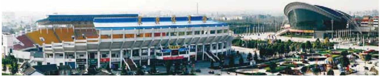
A number of physical exercise and recreation places have been built up in the urban area of Xiangfan. This is the stadium

The development objective of Xiangfan is to endeavor to, by 2020, stand upright at the bank of the Hanjiang River as a new vigorous and efficient industrial city, a regional center of balanced development, a livable home of security and ecology, a famous pioneering and innovative cultural city, and an indispensable central city with brand-new appearance among the Middle and Western Regions.